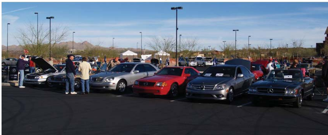
Oro Valley Car Show, March 12, 2011