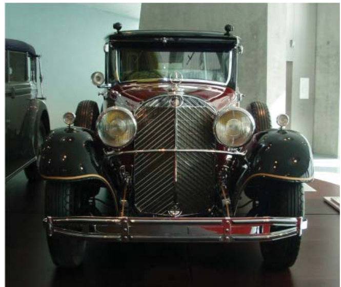
1935 Mercedes-Benz 770 Grand Mercedes Pullman Limousine. 18.03.2010