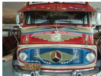
1969 Mercedes-Benz LO 1112 bus